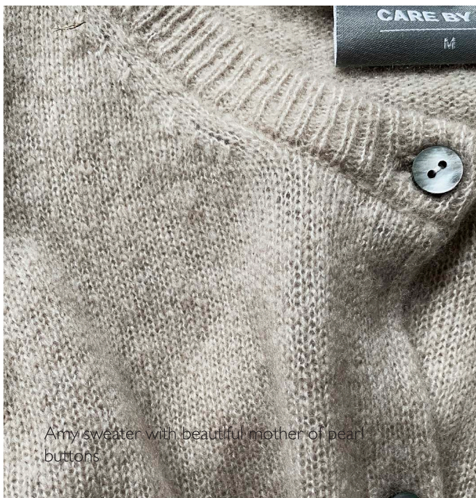
Amy sweater with beautiful mother of pearl buttons