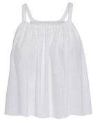
IN-160-400/22-55 Vivienne top 100% organic cotton gauze OS