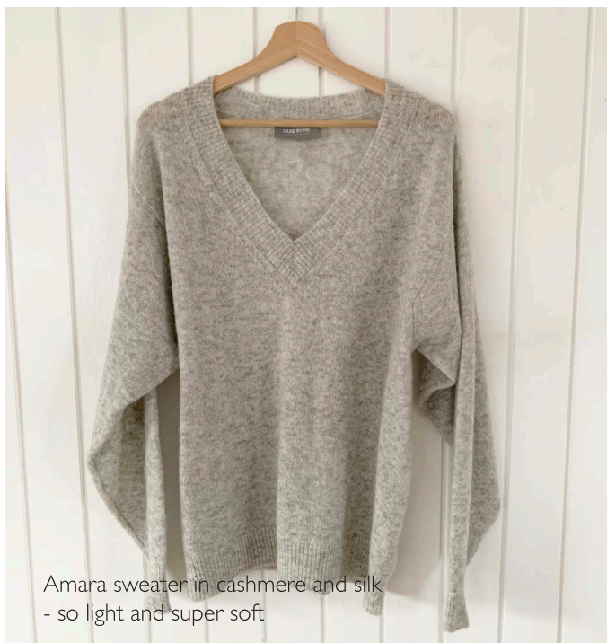
Amara sweater in cashmere and silk - so light and super soft