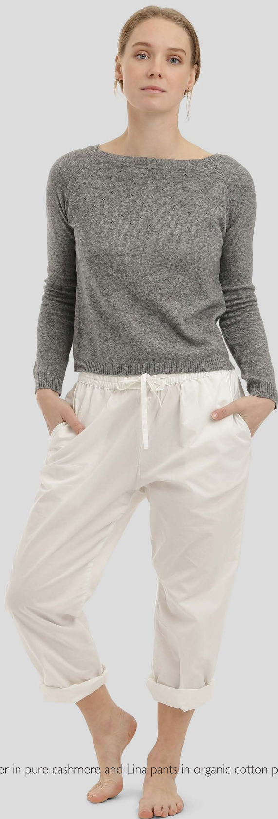
Joy sweater in pure cashmere and Lina pants in organic cotton poplin