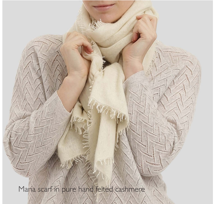
Maria scarf in pure hand felted cashmere

SPUN scarf is woven in pure cashmere that is hand spun. The fact that it is spun by hand makes the thread uneven and this detail gives the scarf a unique and very beautiful finish.