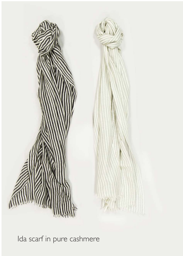
Ida scarf in pure cashmere