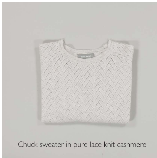
Chuck sweater in pure lace knit cashmere