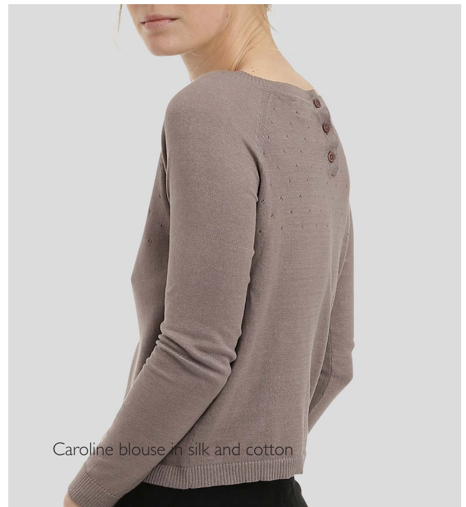
Caroline blouse in silk and cotton