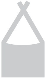
NP-150-375/22-55 Hang 100% linen OS