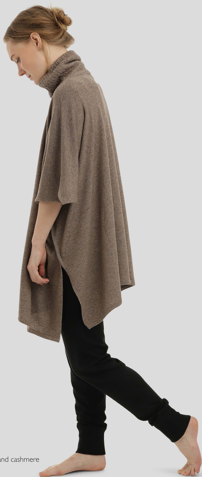
Vanessa poncho in wool and cashmere