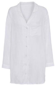
IN-300-750/40-100 Vivienne long shirt 100% organic cotton gauze S-M-L