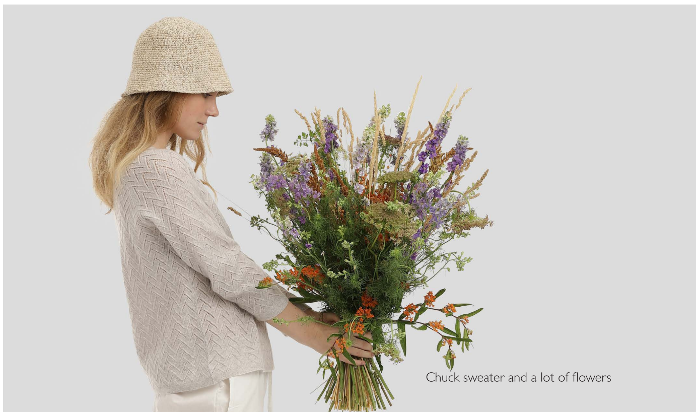
Chuck sweater and a lot of flowers