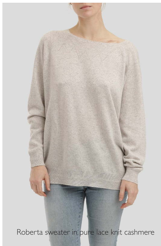
Roberta sweater in pure lace knit cashmere