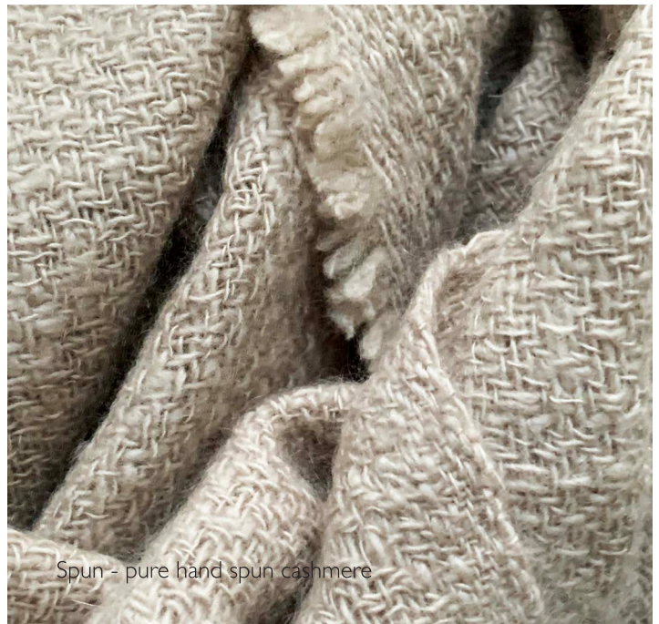
Spun - pure hand spun cashmere