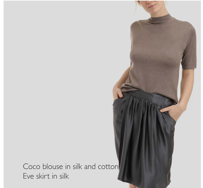
Coco blouse in silk and cotton Eve skirt in silk

EVE skirt is made in pure silk and fits very well with all our tops.