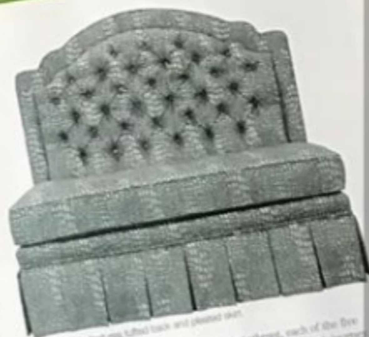
the Magnolia features tufted back and pleated skirt.

"It wasn't until much later that I realized that it was my not only my passion, but my country. My perspective on design is a very personal one," she says. "I love creating spaces that are a bit sophisticated but still very approachable, easy and usable. I'm also a big fan of color and pattern, and my projects are often laced with both."