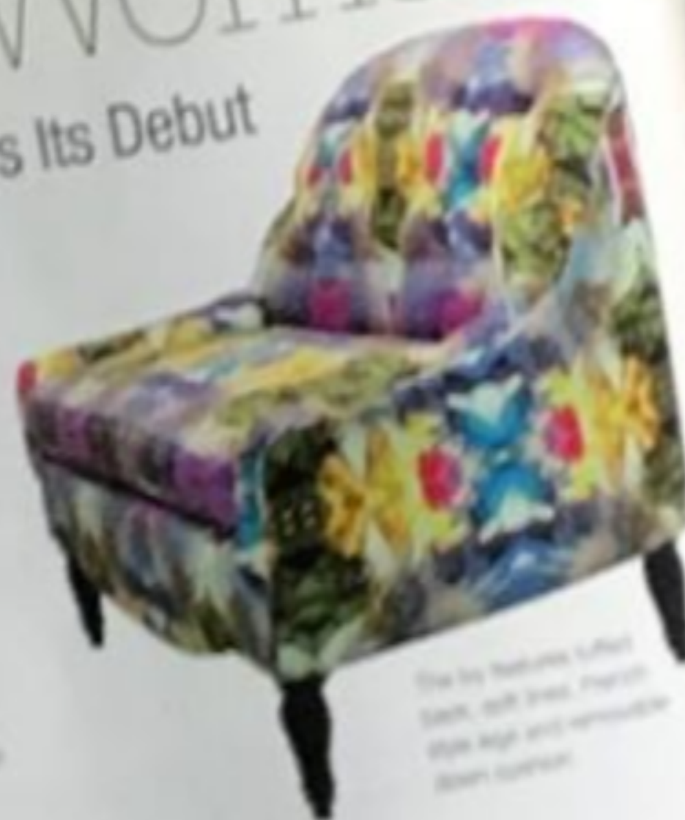
The 10 features listed back, all from the 1990s and 1980s and 1970s.