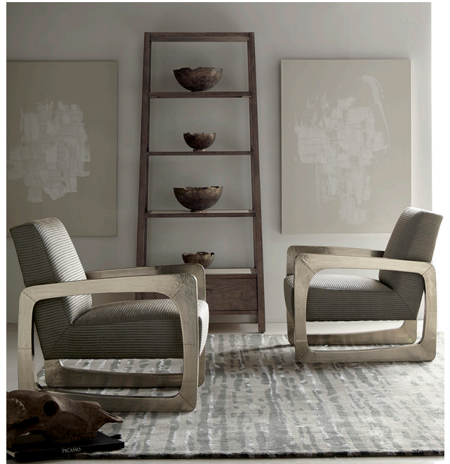
Silvain Chair N3702 suggested retail $1580. Chilton Etagere 369-128, suggested retail $1940.

Sasha Chair N1113SL. Flickering light. An organic Neo-Nouveau floral pattern is hand-carved in wood and then hand-clad in glimmering German silver on this classic barrelback swivel chair. Shown in