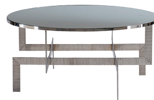
Tyra Round Cocktail Table 369-013, suggested retail $2470.