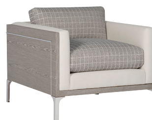
Gage Chair N1202, suggested retail $2060.