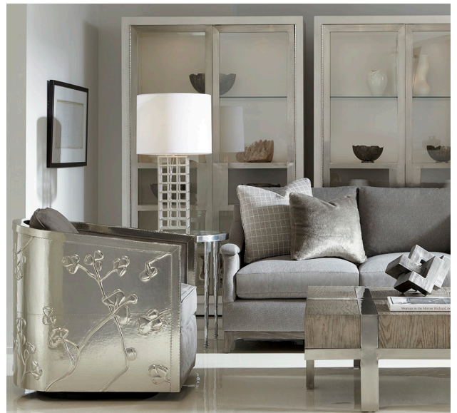
Sasha Chair N1113SL, suggested retail $3575. Leigh Cocktail Table 369-023, suggested retail $3055. Linwood Sofa N1107, suggested retail $3025. Ellesmere Display Cabinet 369-360, suggested retail $6110. Acton Round End Table 369-108, suggested retail $1247.