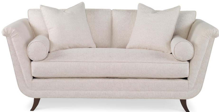
Cosmo Sofa (1212-01) - This retro-inspired sofa features flaring arms tied together with a U-shaped front border. The boxed bench seat cushion is raised on curving solid beech legs and is topped with two boxed back pillows. Two bolsters and two 20" throw pillows accompany the sofa. Use this sofa in pairs for a dramatic stylish focal point.