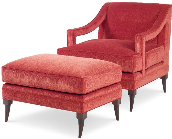
Perry Chair (215-00) - A unique take on the classic lounge chair – this sleek upholstered design has open arms bordering the tight back finish with two upholstered buttons. And a loose boxed seat cushion is raised on tusk beech legs.