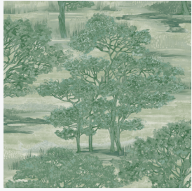
FOREST TOILE Peel and Stick Wallpaper

Featuring scenes of nature and wildlife, Forest Toile captures the romanticism of pastoral life and reflects the enduring popularity of toile patterns in Heritage Style interiors. The distressed design gives the appearance of real canvas, adding a lush landscape of trees across your interior. Forest Toile is available in green, red, and blue colorways.