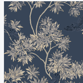
PARLIAMENT Unpasted Wallpaper

The highly popular Queen Emma was inspired by the colorful buildings that reside beside the water in Curaçao. Taking in the gorgeous views, design duo, She She decided that if they could design their own city, this is what it would look like. This print exudes a royal aesthetic with its elaborate arches and regal colorway and pays homage to the majestic designs of historical monarchies. Queen Emma is available in Lopen, Borgen, and Tempaper & Co.'s newest Salt colorways