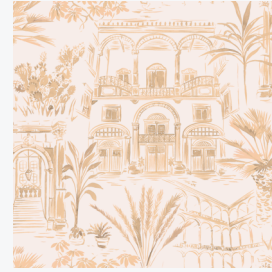
BOULEVARD TOILE Unpasted Wallpaper

Featuring scenes of nature and wildlife, Forest Toile captures the romanticism of pastoral life and reflects the enduring popularity of toile patterns in Heritage Style interiors. The distressed design gives the appearance of real canvas, adding a lush landscape of trees across your interior. Forest Toile is available in green, red, and blue colorways.