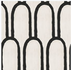
QUEEN EMMA Peel and Stick Wallpaper by She She

Stroll down this beautiful boulevard and bask in the warmth of the sun. Palm trees and art deco architecture are featured throughout this tropical non-pasted wallpaper design, bringing structure into any space, and transporting you to your favorite faraway destination. Boulevard Toile is available in three colorways: coral, grey, and coastal green.