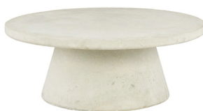
9900-03C ROUND COCKTAIL TABLE CHALK FINISH W42 D42 H16 SUGGESTED MSRP: $1688