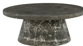
9900-03S ROUND COCKTAIL TABLE SLATE FINISH W42 D42 H16 SUGGESTED MSRP: $1688