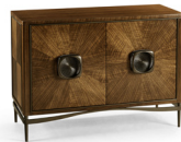
Two Door Accent Cabinet