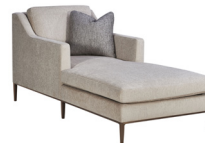
Two Arm Chaise