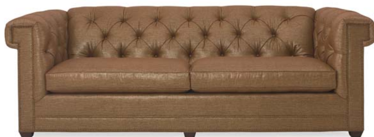
3111 Claybourne Long Sofa Bronzed Copper