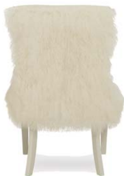
6065 Chai Chair Fur has the look

Mongolian sheep skin chairs playfully beckon like a rocker chick's mohair sweater.