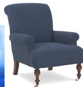
2425 Parrish Chair

CR Laine pieces pair perfectly with cobalt blue accessories like the Peyton Lacquered Nightstand from World's Away and Pagoda Mirror by Barclay Butera for Mirror Image. Even more stunning is this custom stretched canvas artwork from Black Crow Studios in varying shades of blue.