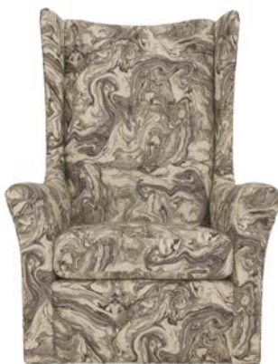
1335-SW Copley Swivel Simply "Marbelous" !