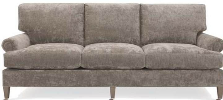
CD8801R Custom Design Long Sofa Lush Texture in Smokey Platinum