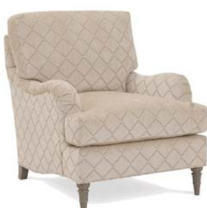
CD8805E Custom Design Chair Icy Porcelain with Warm Texture