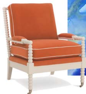
9125 Spool Chair Tangerine Orange