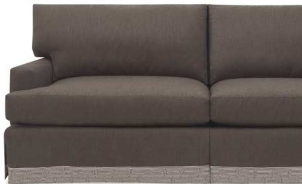
CD8801T-2 Custom Design Sofa Fret Skirt Band