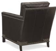
L5535 Gotham Chair Leather with Studded Cuffs

Reminiscent of a studded leather jacket, our black leather chair is adorned with alternating nickel and pewter nails, a detail that feels more polished than rough.