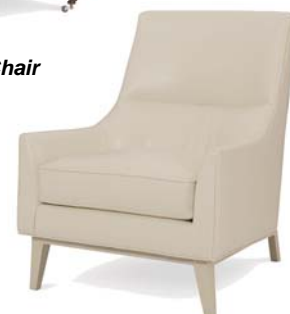
415 Hans Chair