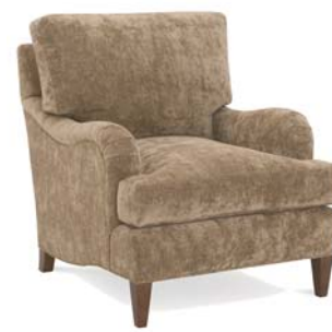
CD8805E Custom Design Chair Posh Bronze