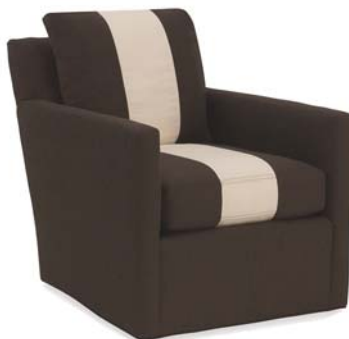
5745-SW Oliver Swivel Banded Seat Cushion

Mongolian sheep skin chairs playfully beckon like a rocker chick's mohair sweater.