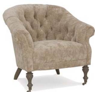
1805 Darby Chair Rich Cocoa