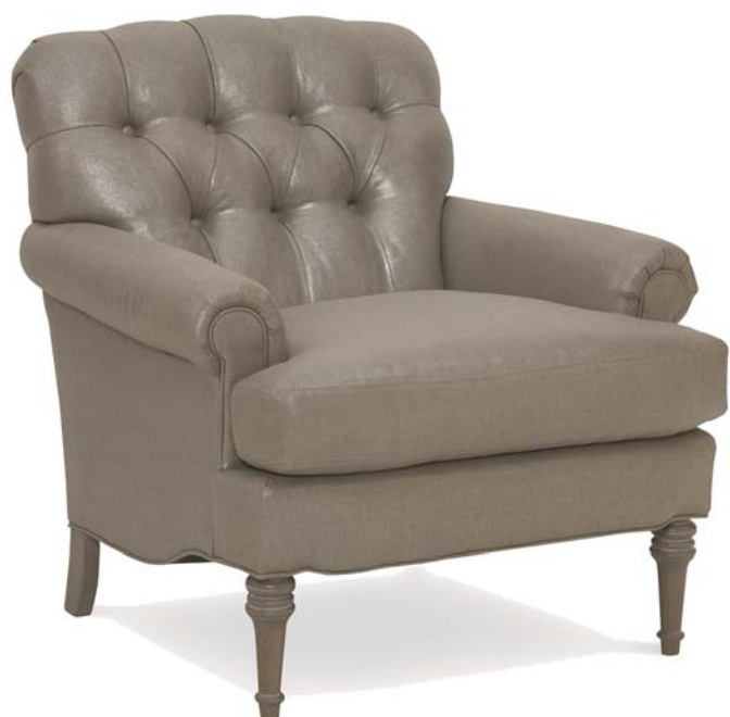
2375 Wagner Chair Glazed Linen in Platinum

As we head toward 2014, bronze and platinum are imbuing furniture design with an elegant shine — from glazed linen fabrics to shimmering finishes and nail trims. Like light reflecting off a coastline, platinum can be icy white or a warm shade of cocoa, and bronze ranges from copper to patina. Mixed and matched hues, like bangles stacked together, gives metal a soft touch with posh appeal.