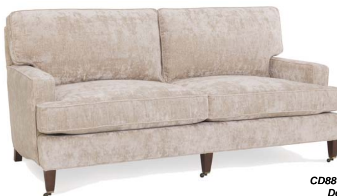
CD8800T-2 Custom Design Sofa