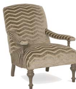
1665 Aleo Chair Luxurious Chevron