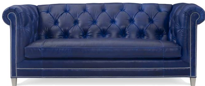
L1800 Topeka Sofa Cobalt Leather accented with Painted White Legs and Pewter nail trim

From Ming dynasty porcelain to Dutch delftware, cobalt blue has been fired into décor for centuries. Recently, the vibrant color has reignited on the runways. It lit up Joan's striking dresses on Mad Men, and it dazzled at Valentino's fall/winter show during Paris Fashion Week. This season, watch for the brilliant blue to brighten home design, particularly when paired with saturated orange tones and tailored white accents. Intense and full of life, this is one hue that won't flame out.