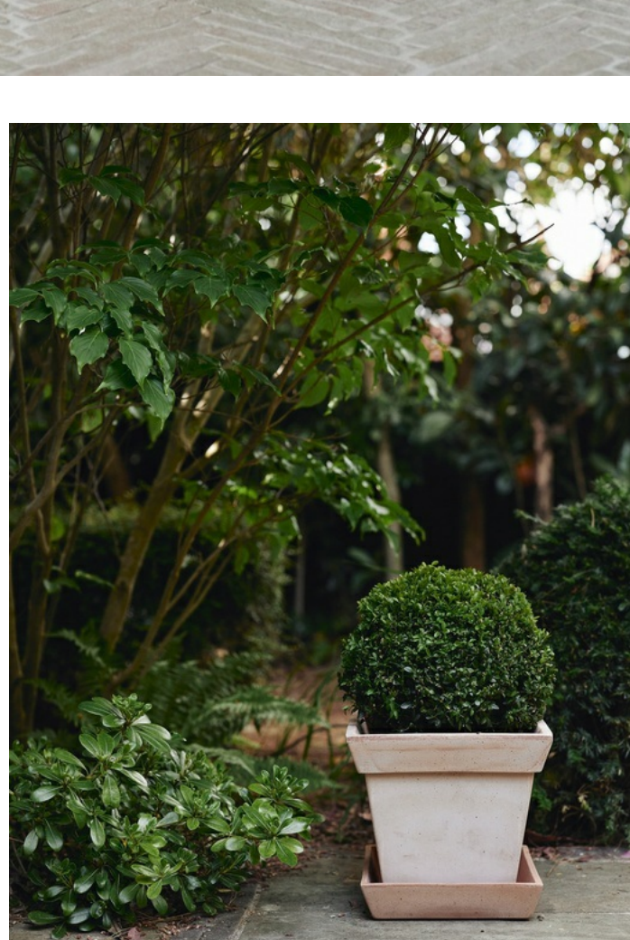
Transform the terrace or front porch with Gaia pots, perfect for framing doorways and creating a welcoming, stylish entrance to your home.