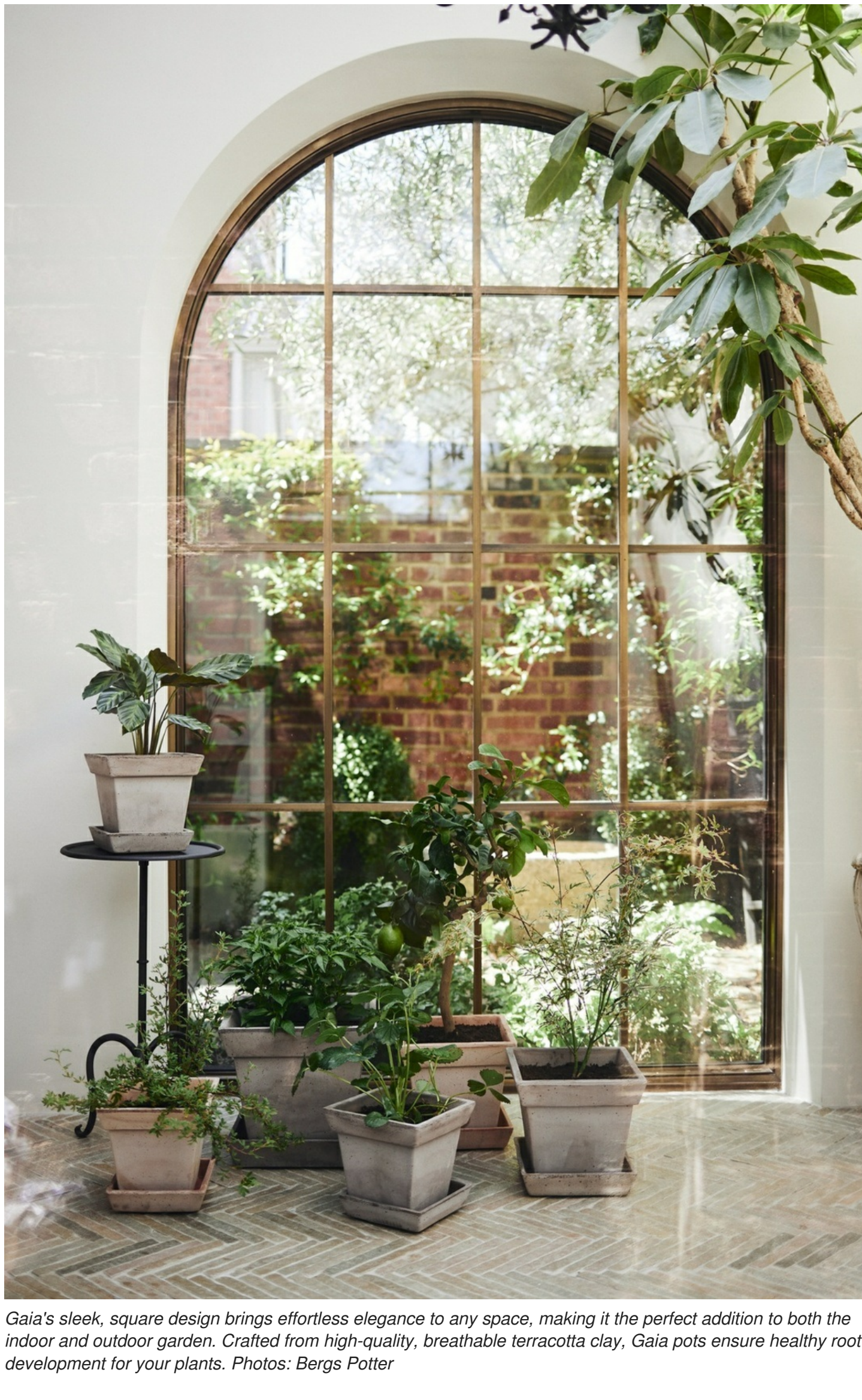
Gaia's sleek, square design brings effortless elegance to any space, making it the perfect addition to both the indoor and outdoor garden. Crafted from high-quality, breathable terracotta clay, Gaia pots ensure healthy root development for your plants.