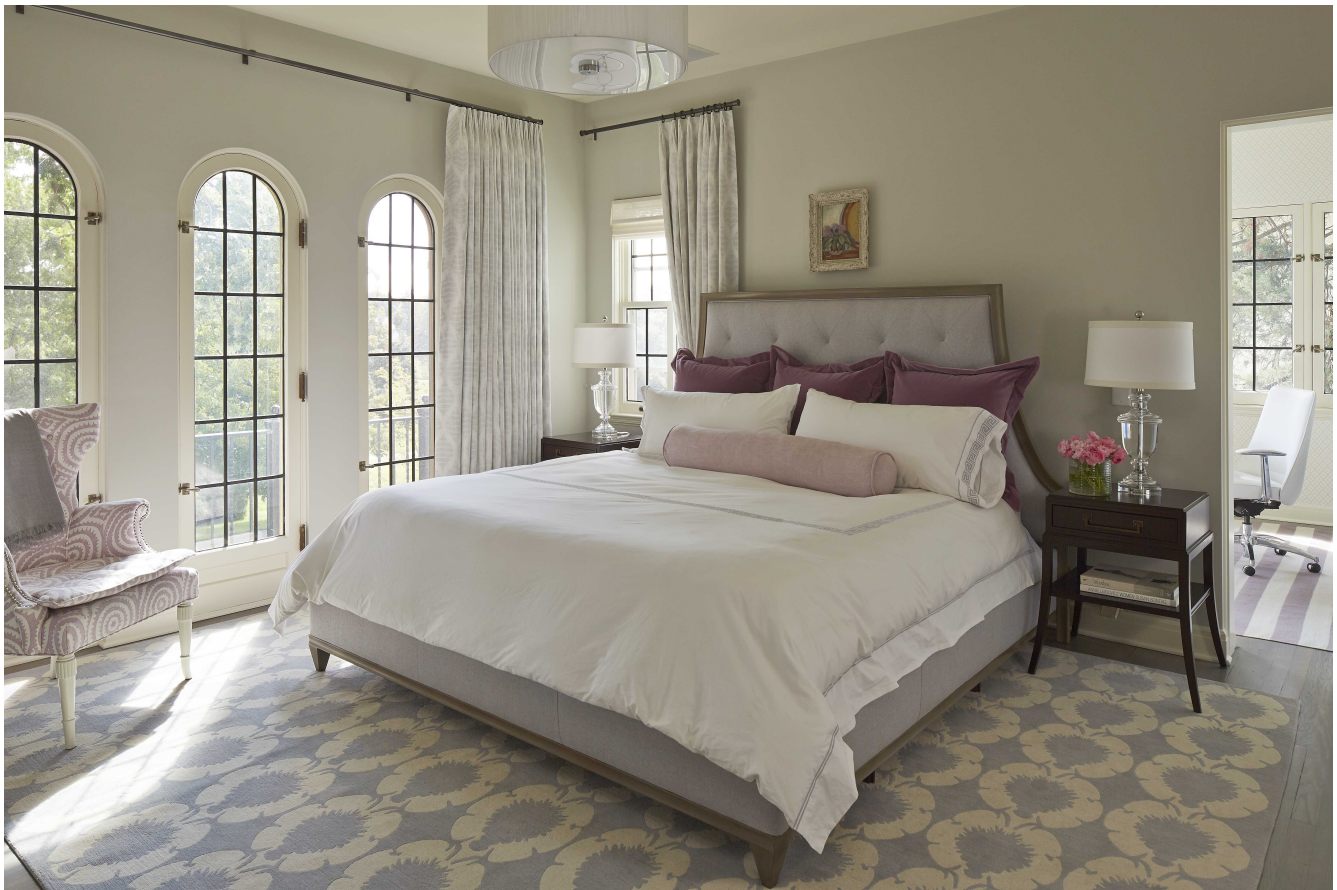
Rings of Roses Room designed by Martha O'Hara Interiors