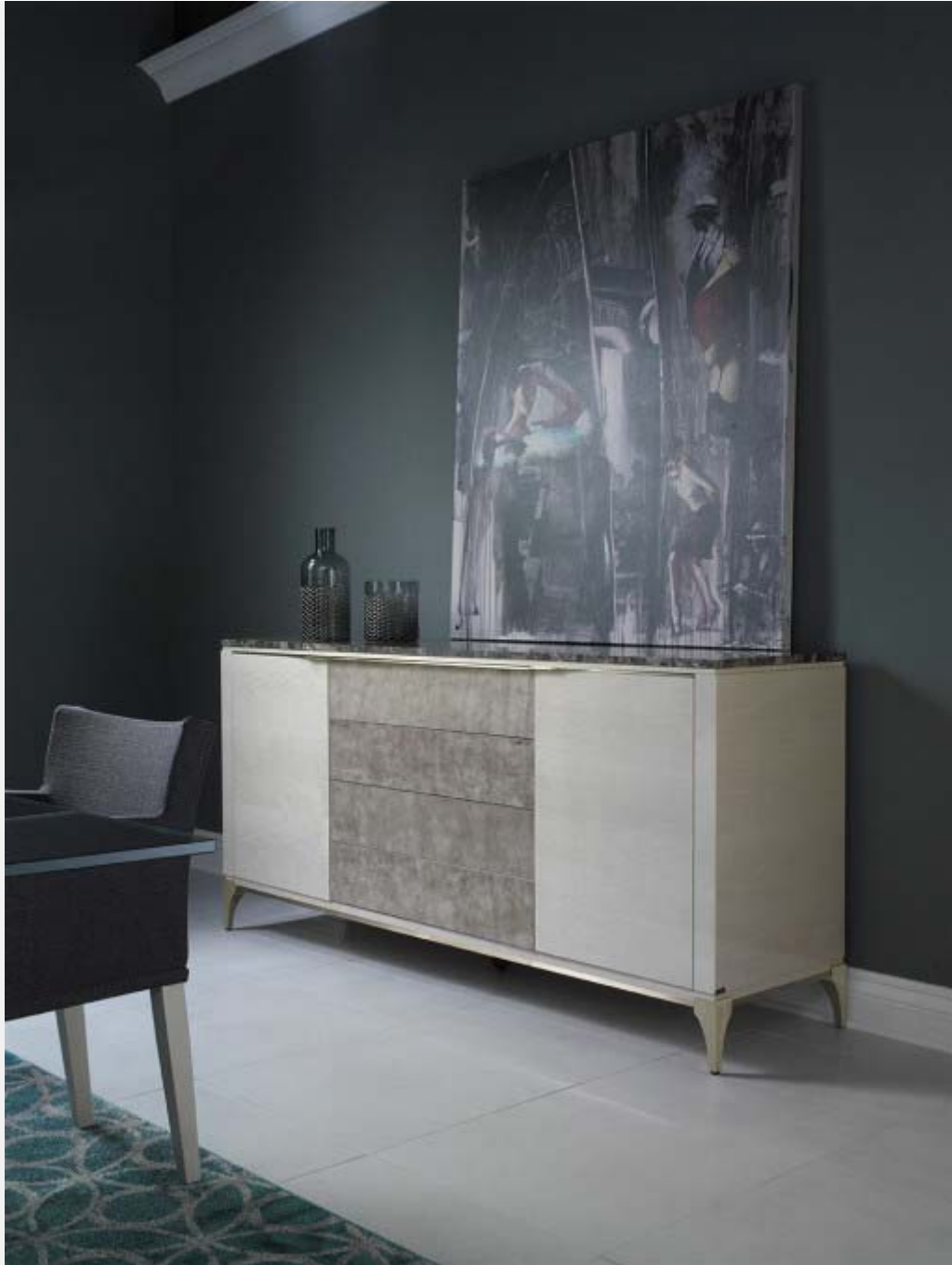
SOHO dining room, HURTADO

SOHO maintains true to not only the feel of style but also the quality of Hurtado. SOHO features clean and pure designs, with subtle interplay of geometric almost architectural form that accentuates the contemporary ambience of the line.