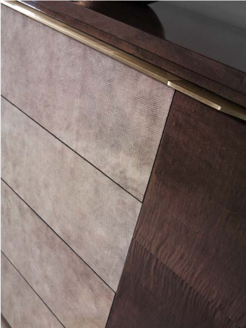
SOHO sideboard, detail

SOHO refines newer trends by adding marble tops, leather, and brass to add the right touch of style and sophistication.