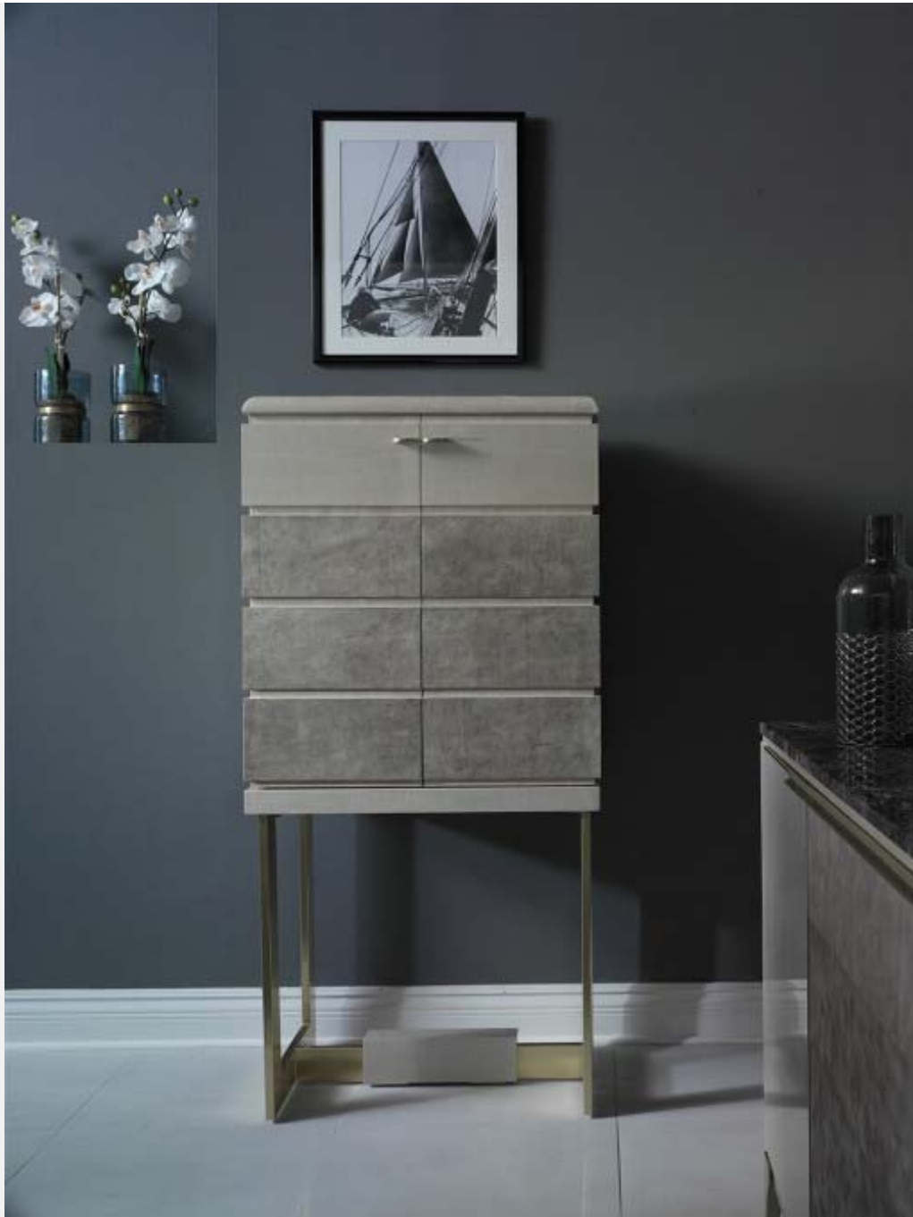
SOHO Bar Furniture, HURTADO

Founded in Valencia, Spain, in 1940, HURTADO enjoys a renowned international reputation for its excellent furniture collection both in classic and contemporary style. While hand carvings, exquisite inlays and finishes enrich the TRADITIONAL collections , the collections of the contemporary EVOLUTION line , such as MON, CITY or SOHO, feature a subtle interplay of linear geometric shapes, manufacturing skills and more contemporary materials and finishes.